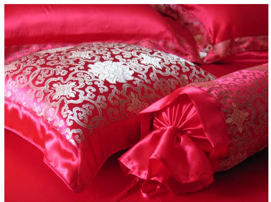
Silk Brocade+ Silk Crepe Satin/ 4 Pieces Duvet Set For Wedding