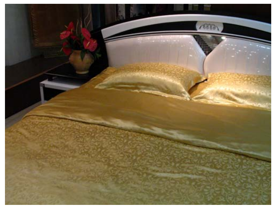
Full Width 100% Silk 4 Pieces Duvet Set